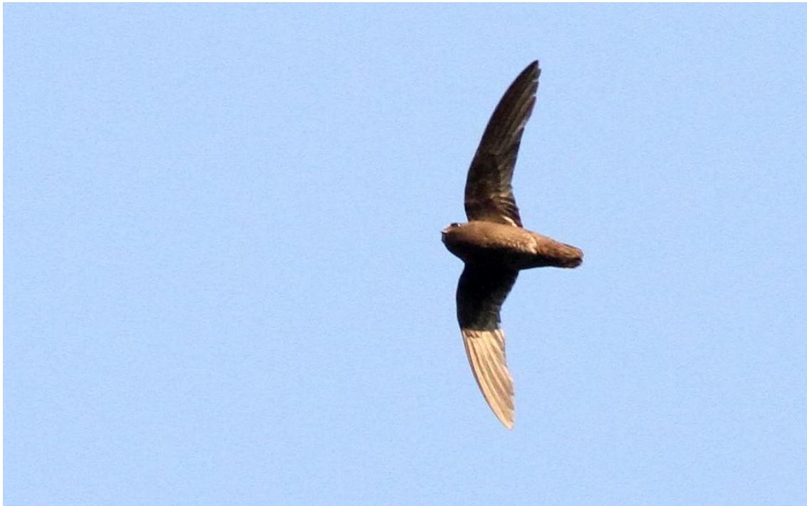
White-chinned Swift

WHITE-CHINNED SWIFT Cypseloides cryptus One of the rarest species found during this trip. 20+ seen flying low at Morro de Calzada. Some excellent pictures have been taken!!