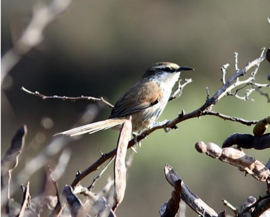
Great Spinetail

BARON'S SPINETAIL Cranioleuca baroni Peruvian endemic 2 seen very well at Cruz Conga.