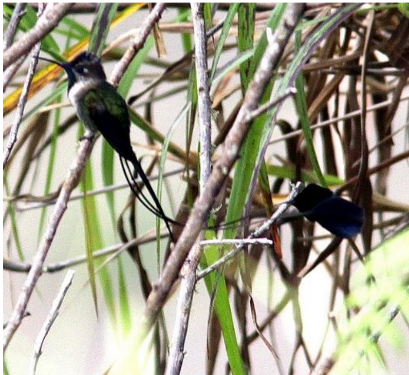
Marvelous Spatuletail

At the ECOAN and Leymebamba museum feeders.