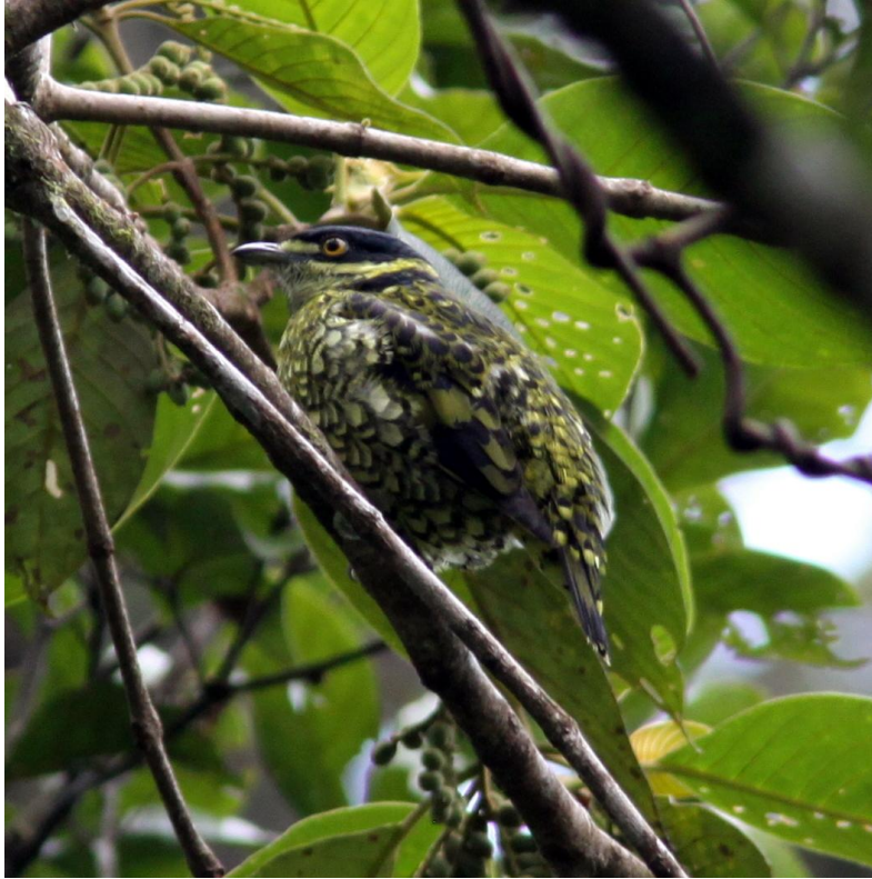
Scaled Fruiteater, bird of the trip for the leader (below)