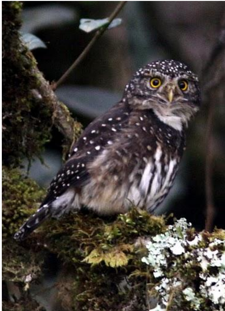
Yunga's Pygmy-owl, picture Susan Gilliland