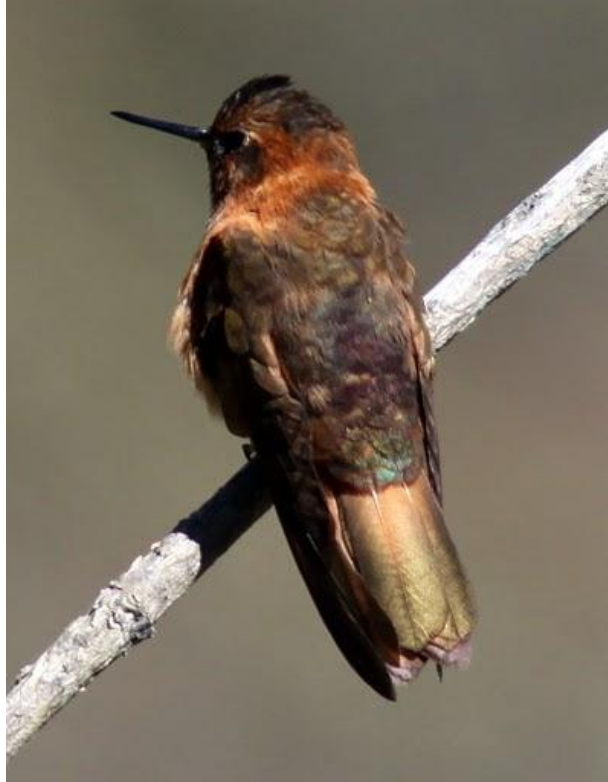
Shining Sunbeam

BRONZY INCA Coeligena coeligena 1 at the ECOAN feeders