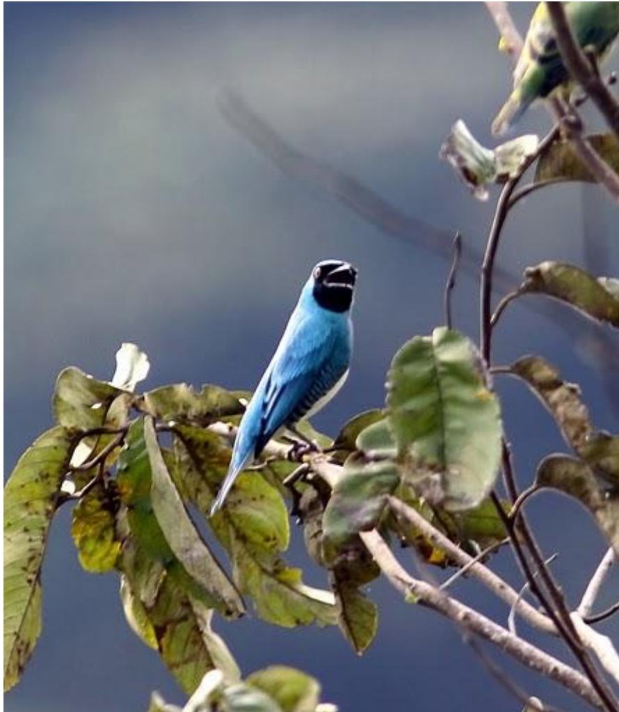
Swallow Tanager

Excellent views at the Tarapoto tunnel and Morro de Calzada