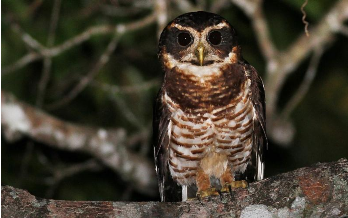
Band-bellied Owl, picture Mark Scheel

Spectacular views below the Tarapoto tunnel, where we heard a few more.