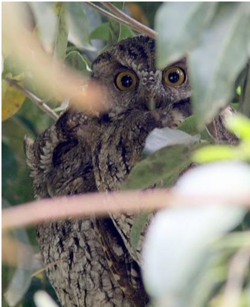
Koepcke's Screech-owl, picture Susan Gilliland

2 birds at the usual roost in the Utcubamba river.