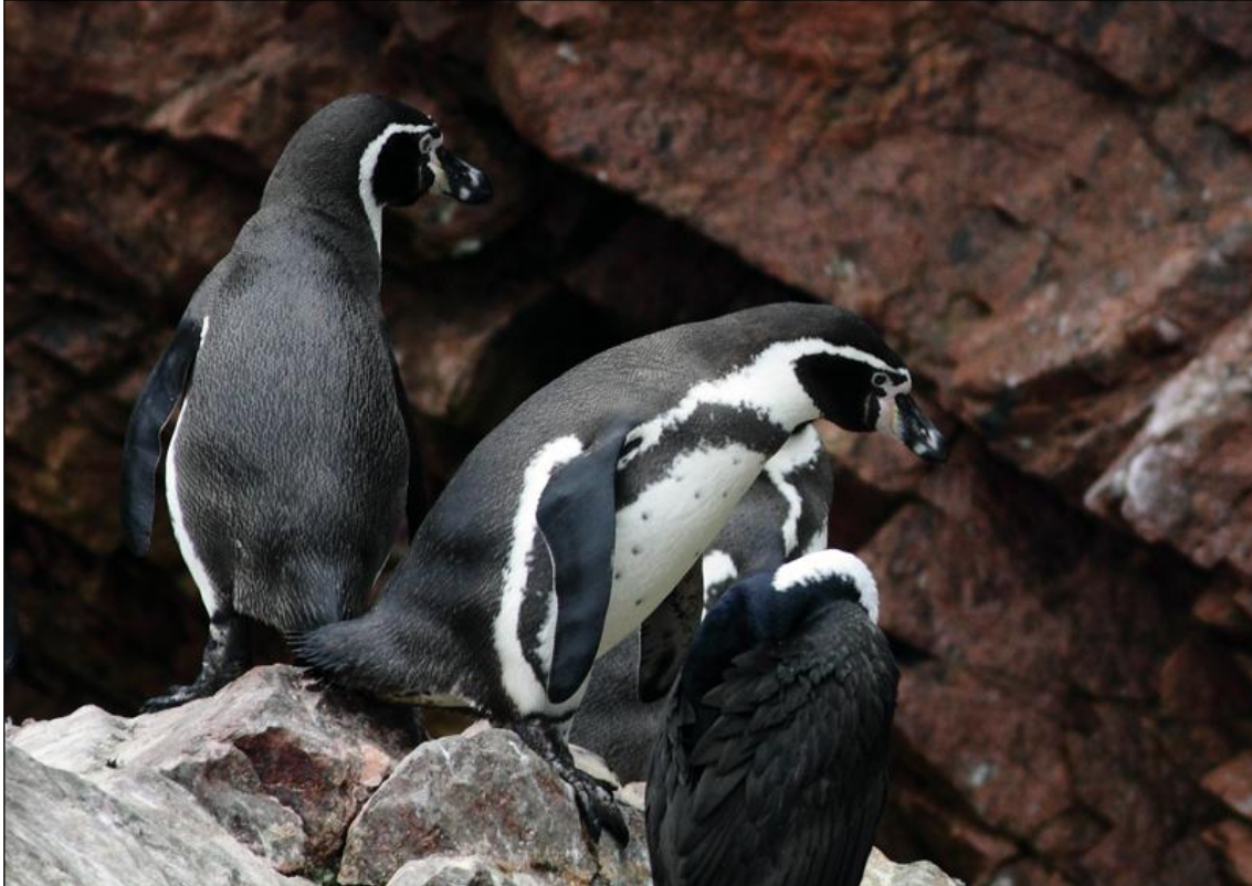
Humboldt Penguin