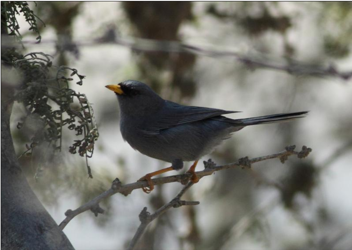
Slender-billed Finch