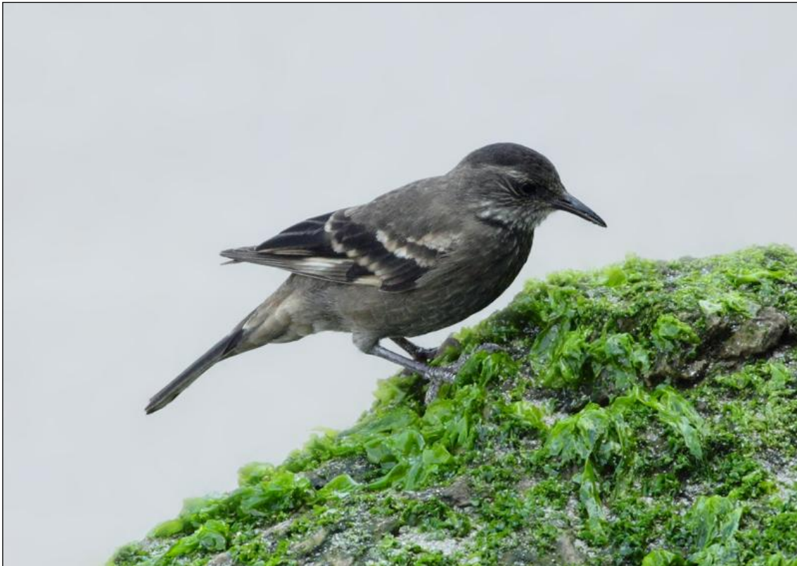
Surf Cinclodes

Wren-like Rushbird ( Phleocryptes melanops )