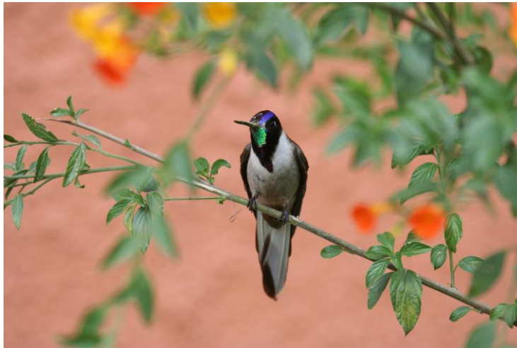
Bearded Mountaineer – Fabrice Schmitt