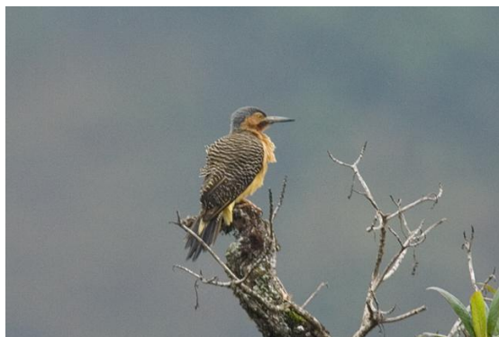
Andean Flicker