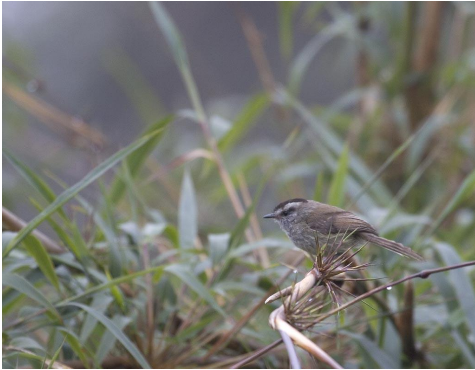
Unstreaked Tit-tyrant