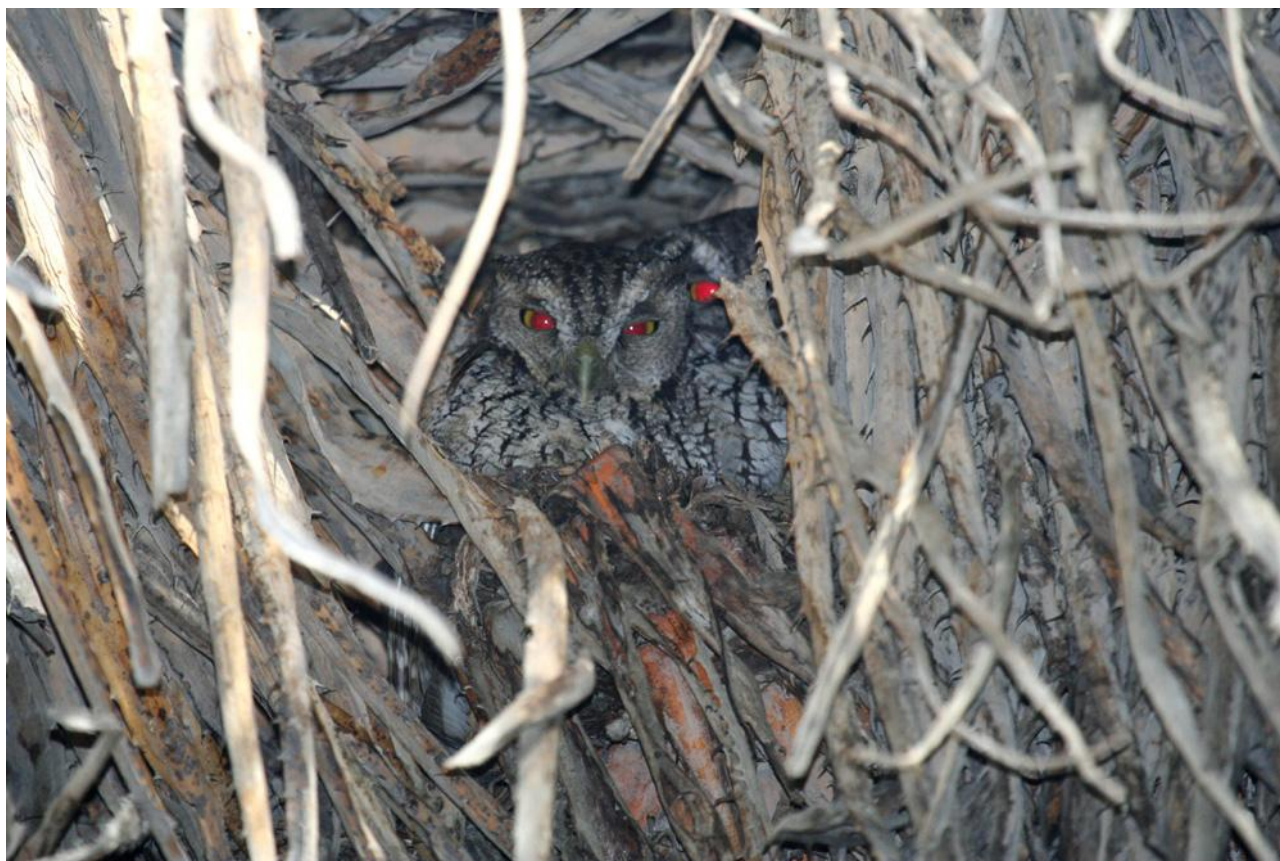
Koepcke’s (Apurimac) Screech-Owl – Silverio Duri

Oh yes! We were initially slightly worried about this guy because the first time along the Andahuaylas road we didn’t get to see it at dusk, but at pre-dawn the next day at the Colonial Pachachaca bridge, after a lot of effort and at the very last time 2 of them came in a very good distance and we got good views and pictures. These Apurimac birds may represent an undescribed subspecies – slight vocal differences between these and the northern Peruvian populations, and they tend to ignore playback of the northern calls.